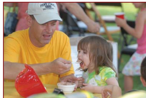
The Ice Cream Festival is a family-friendly event.

There are many events planned for late summer and autumn 2010, including lectures, field trips, and more.