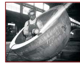
Lukens employee grinding a pressed head.