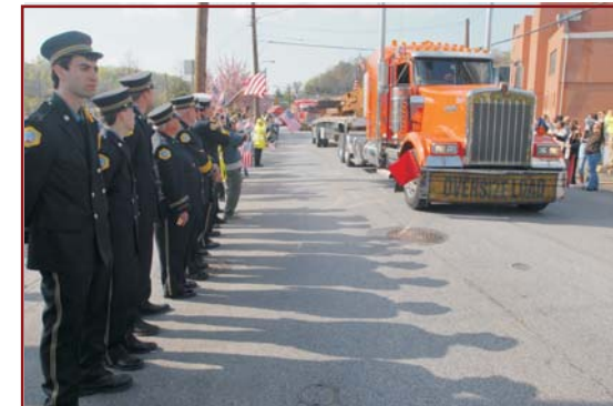
Members of the Downtown Fire Department stand at attention as the trucks rolled into the Historic District

Ever since the rescue operation at Ground Zero became a salvage operation, The Graystone Society has been working quietly to bring some of these huge