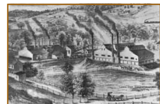
1865 Engraving of the Mill