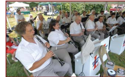
The Lukens Band performing.

Our Bicentennial celebration starts on June 26 with a Marker Dedication. There will be exhibits and refreshments will be available. On July 2 we mark the actual 200 th Anniversary date with a Tree Planting ceremony. Also there will be a ceremony to commemorate the tragic events of September 11, 2001 on the anniversary date. For details please refer to the Calendar of Events at left or go to www.lukensnhd.org and click on the Events button.