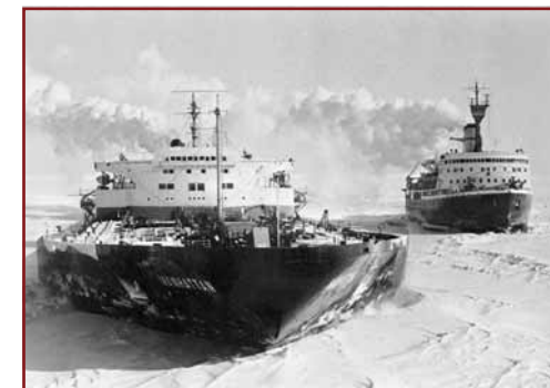
Lukens steel went into the S.S. Manhattan, the first commercial vessel to transit the "Top of the World" route.

During this period Lukens diversified by purchasing Allenwood Steel, the facility in Conshohocken (which now runs a Steckel mill), and Washington Steel with a stainless operation. However industrial decline in the northeast and midwest saw the rise of the rust belt. At Lukens this meant the closing of the Open Hearths, and the sale of the Spun Heads division and Lukenweld.