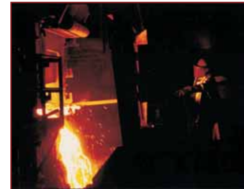
Tapping the Electric Arc Furnace

The first Electric Arc Furnaces came on-line in the late '50s — replacing the old Open Hearths. These furnaces reduced drastically the time between taps from 8 hours per heat to 1.5 hours per heat. They used less fuel and the electricity, they