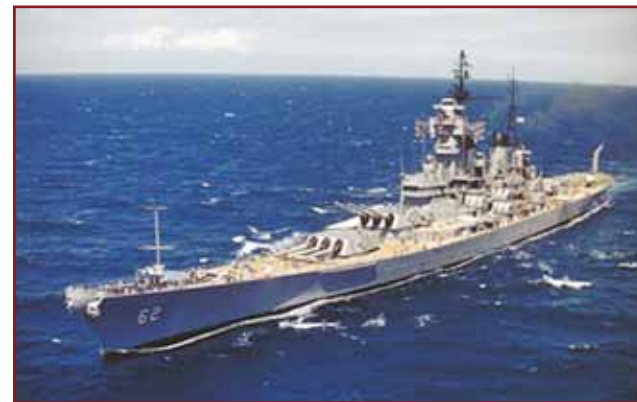
The Battleship U.S.S. New Jersey.

For more information go to the Naval Academy website at www.usna.edu and click on the link for the Naval Academy Museum.