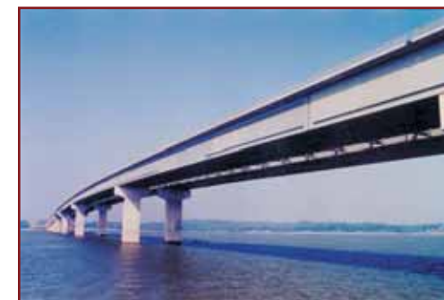
Lukens produced a great deal of structural steel for use in bridges.

In 1997 Lukens Steel was sold to Bethlehem Steel. When that company went into bankruptcy in the early 2000s, the Coatesville plant was bought by International Steel Group. ISG was bought out by Mittal in 2003, and since Mittal merged with Arcelor Steel in 2006 is now part of ArcelorMittal.