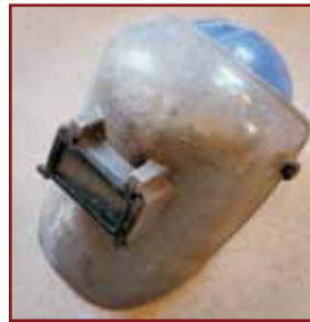
Welders face mask.

Thanks to a generous donation from ArcelorMittal we have added the contents of Lukenweld Building #1 to our collections. Included in this acquisition is a pressure vessel, some Open Hearth crane hooks, tools, equipment and machines. We were also able to salvage three "Lukens Blue" picnic tables from the locker room. The salvaged objects are currently in storage.